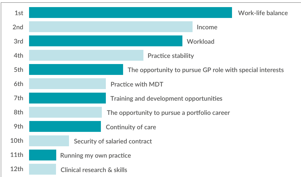
Figure 2: “What factors are most important to you in your GP career?” NI ST3 GP Trainees’ responses, ranking from most to least important 20

GP Trainees: While the majority of the almost 60 trainees who took part in the RCGPNI session with ST3s indicated that they planned to stay and work as a GP in Northern Ireland, around 17% were planning to work elsewhere or were undecided about their plans post-CCT. In relation to their career priorities, the principal factor which would encourage ST3s to stay in the Northern Ireland workforce was a manageable workload, followed by state-backed indemnity, fair terms and conditions, and more core funding for general practice. Trainees also felt the impact of negative public perceptions of general practice, and they were concerned about the learning and development opportunities lost through the de-funding of General Practice Elective Care Services (GPECS) clinics.